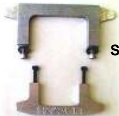
Outboard Prop Shaft Assemblies Item #'s: PSA35 (3.5) PSA75 (7.5/11)