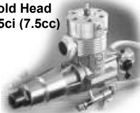
Gold Head .45ci (7.5cc)