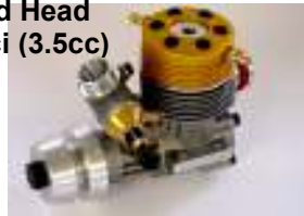
Gold Head .21ci (3.5cc)