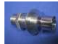
Miscellaneous Fittings, Outlets, Turn Fins, Etc.