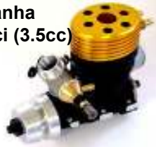
Piranha .21ci (3.5cc)