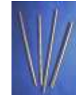
Propeller Stub Shafts For Nitro & Gas Item #'s: SS1874 SS1875 SS2504 SS2505