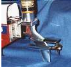
Outboard Flex Cables Item #'s: DC1563S2 (3.5) DC1875S2 (7.5/11)

Bullet Drive™ Electric conversions. Call or write for pricing and conversion information.