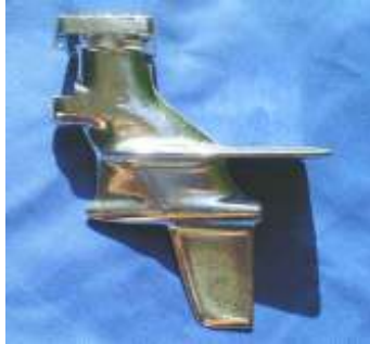
3.5 Bullet Drive™ Item #: 35OBD

3.5, 7.5, & 11 Bullet Drives™ are a one-piece casting finished by CNC-Machining. Each has a Brass tube encased into the casting providing lubrication, cooling and a smooth running lower unit. Consists of lower Unit & motor bolts only.