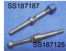
For Electric Application