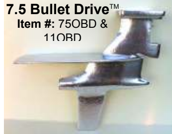
7.5 Bullet Drive™ Item #: 75OBD & 11OBD

3.5, 7.5, & 11 Bullet Drives™ are a one-piece casting finished by CNC-Machining. Each has a Brass tube encased into the casting providing lubrication, cooling and a smooth running lower unit. Consists of lower Unit & motor bolts only.